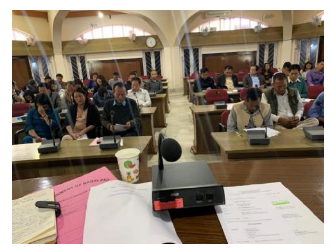
Visit to District Planning Offices: