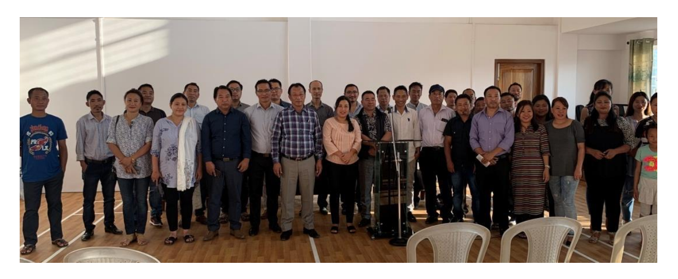
Multipurpose Hall in Planning Quarter Area below Nagaland Assembly Secretariat Inaugurated on 20^{\rm th} May, 2019.