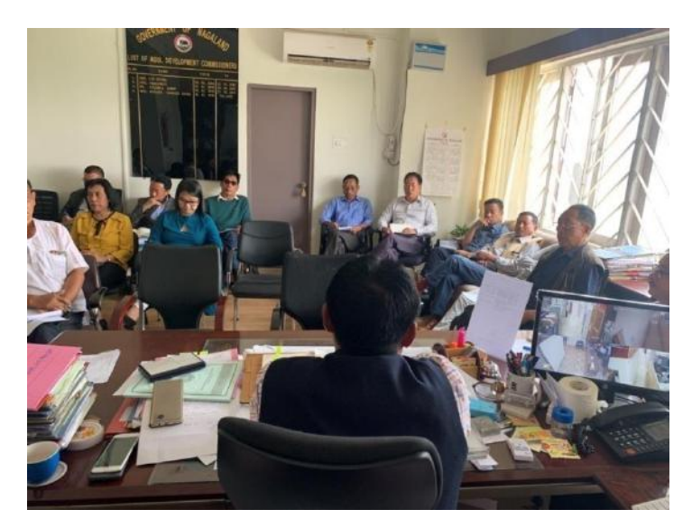
Meeting with the District Planning Officers