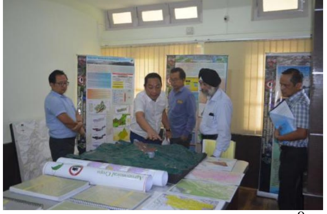
Secretary, DoNER & Team visit to GIS Centre - Highlighting the activities of the Centre

All communication related to the assignments and proposals by line departments and users are addressed to the Project Director, Nagaland GIS and Remote Sensing Centre, Planning and Coordination Department. Charges and fees, if any, are made through treasury challan in favour of "Development Commissioner, Planning and Coordination Department, Government of Nagaland under Head of Account 0075 (Miscl)".